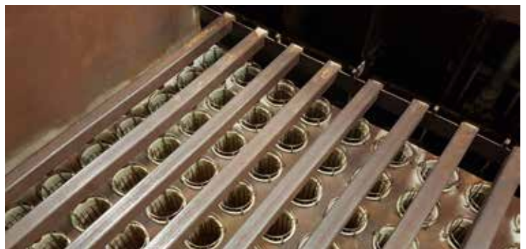
Filter bag lines with cleaning lances