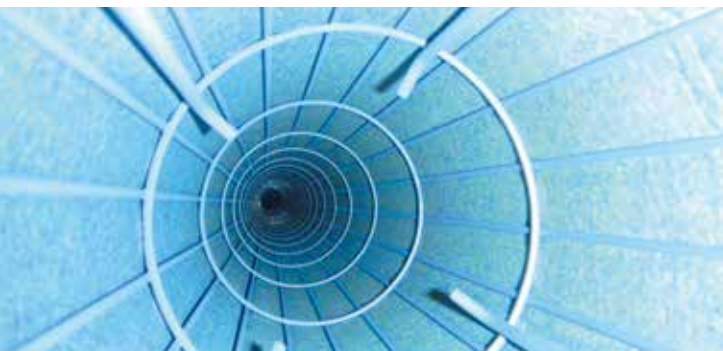
Inner surface of a filter bag after cleaning

If there is a defect in the cleaning system leading to an increase in differential pressure, the control unit pinpoints the relevant valve or filter bag instantly, allowing timely replacement of the faulty element. The new control system thus ensures cleaning is timed perfectly, helping extend the service life of filter bags and reliably detect damage early on to avoid unscheduled downtime and excess emissions.