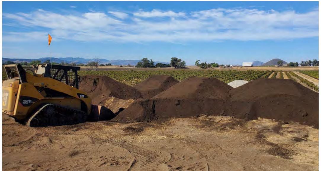
Wolff Vinyards processes around 200 metric tons of compost in their post-harvest soil enriching procedures.

The SLO Kompogas plant and the Booker Noe Distillery are lighthouse projects for a US-wide approach to fossil-free energy. More and more media and environmental organisations are presenting awards to companies making