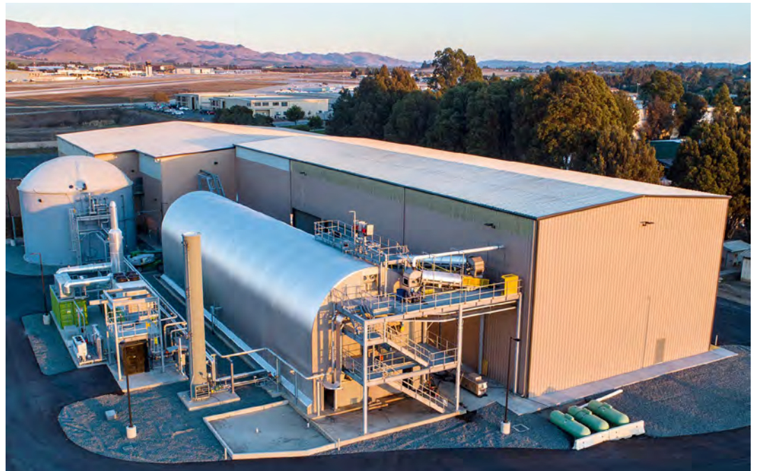
The Kompogas dry AD plant in San Luis Obispo is one of the most advanced installations of its kind in the US

At the end of 2018, the company made the leap to North America with the construction of a Kompogas