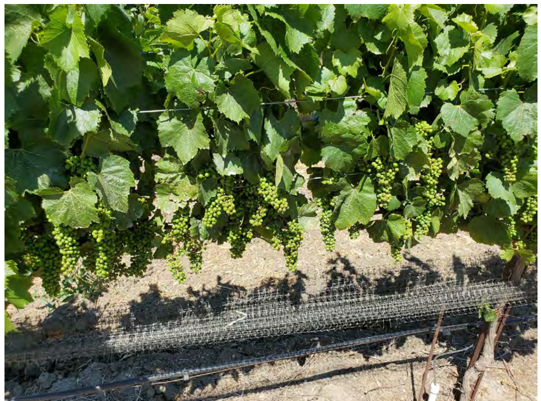
The feedstock is high in sugar and supports the stable production of biogas during the dry season.

However, it is not only wineries that benefit from HZI’s advanced biogas technologies. Booker Noe, and ultimately Beam Suntory, is currently expanding its production facility in Boston, Kentucky. On behalf of 3 Rivers Energy, HZI is building a wet AD plant with an integrated