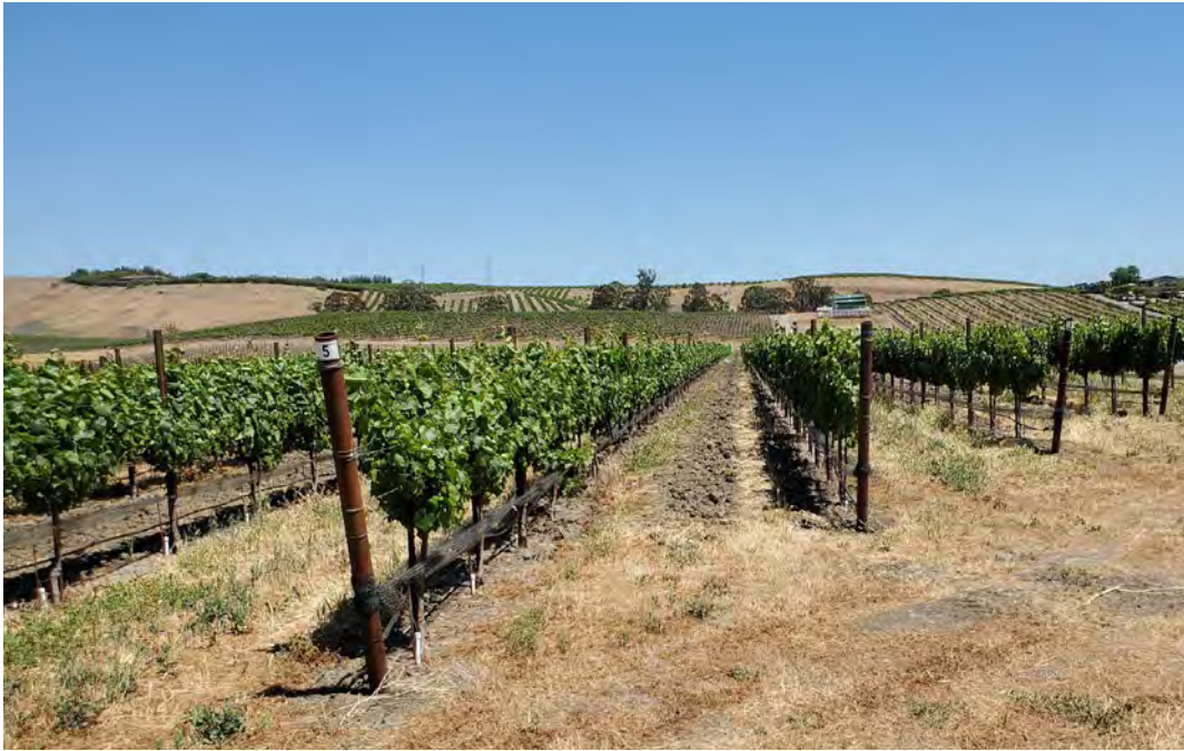
Vineyards deliver their pressing residues

at the end of 2018 the SLO facility has processed over 131,550 metric tons of green waste from households, businesses, and agriculture. In the thermophilic AD process, the digestate is completely sanitised. In an on-site combined heat and power unit the biogas obtained is then transformed into electrical energy – over 11.12 million kWh/a since 2018 – and fed into the power grid. The nutrient-rich compost serves as fertiliser for local agriculture and as soil enrichment for local winegrowers.